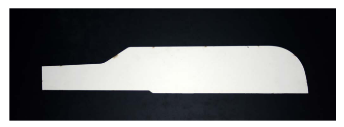
Template for Step 10