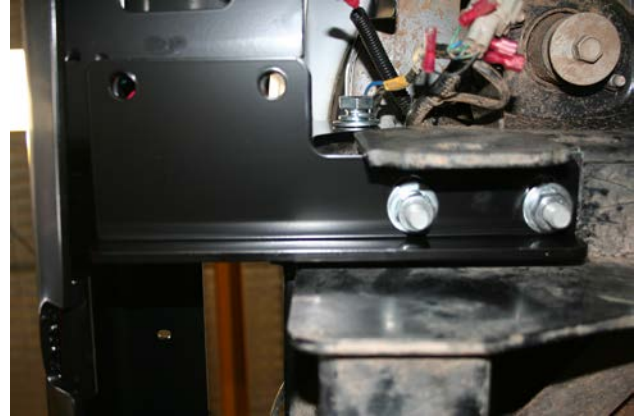
Fig. 9 (showing right side)