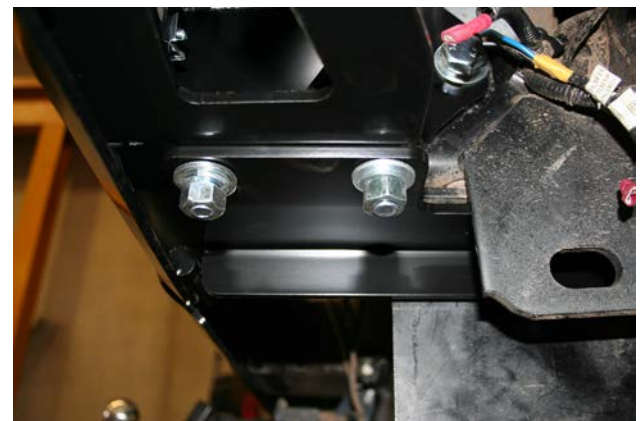
Fig. 10 (showing right side)