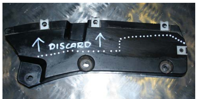
Fig. 11 (showing right side)